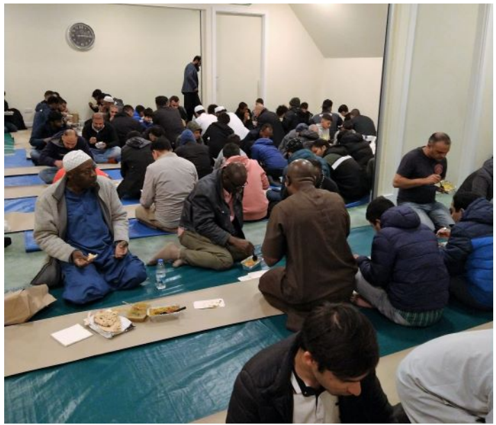
Iftar meal at Dublin Mosque 2022

the Masjid. On the last two weekends (Fri - Sun) of the month, Iftar meals were provided by Al-Khair Restaurant – for a total of six days.