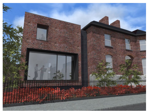
Proposed two storey building on the left