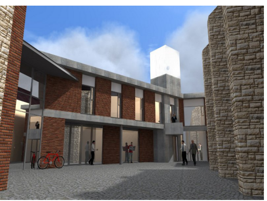
Proposed top floor building

Efforts continued to fundraise for the project. Collections after Friday prayers were made on monthly basis. Direct debt forms were distributed to those who preferred to make monthly donations. Currently there are fifteen (15) brothers and sisters who make monthly contributions to the extension project. The monthly paid monies range between \notin 5 to \notin 100 with an average total of \notin 993.00 per month.