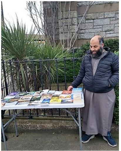
Dawah table outside Dublin Mosque