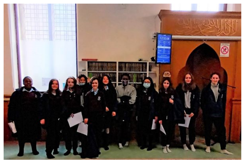
Secondary school students visiting the Mosque

The Islamic Foundation of Ireland has welcomed diverse groups to the mosque and provided workshops and talks on Islam and Muslims. We have had visitors from youth services, third level students studying theology and media. Attendees experienced guided tours of the Mosque, introductory talks on Islam and discussions about life in Ireland for Muslims.