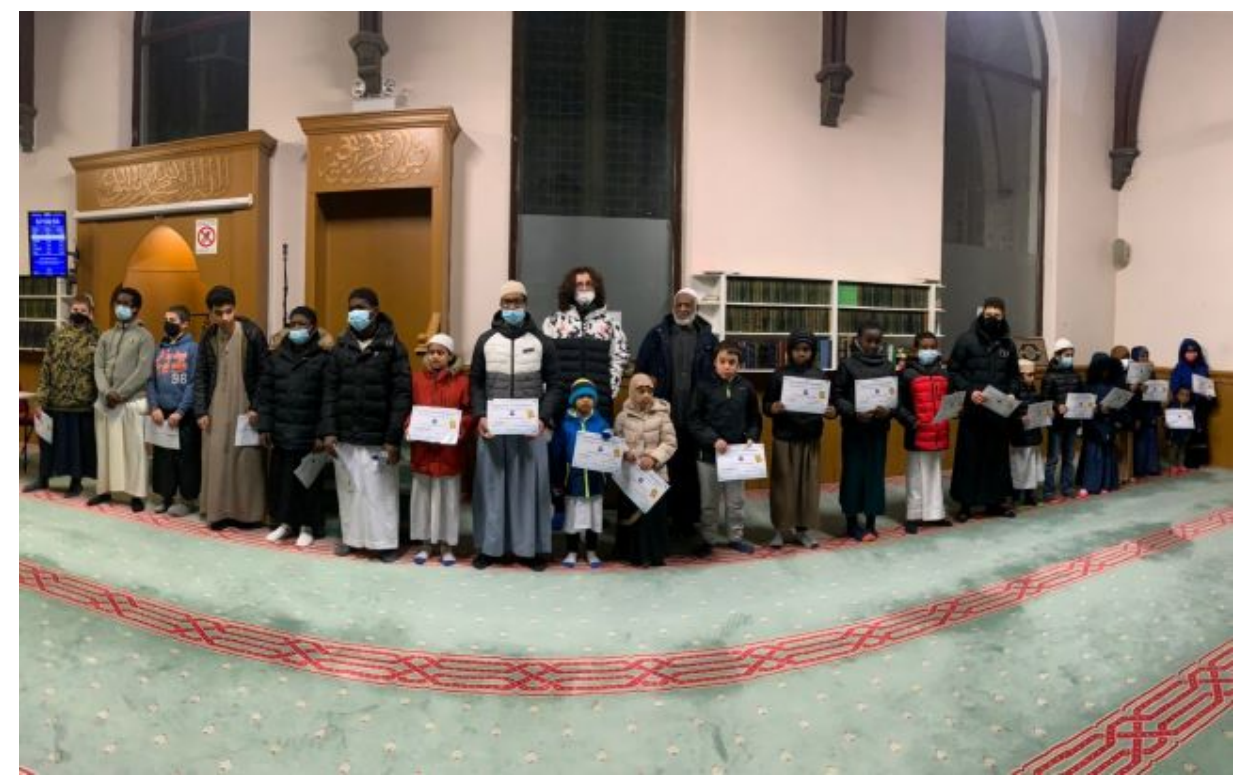
Fajr Knights Challenge for Children & Youth 23/12/ 21- 5/1/22. Ceremony at Dublin Mosque