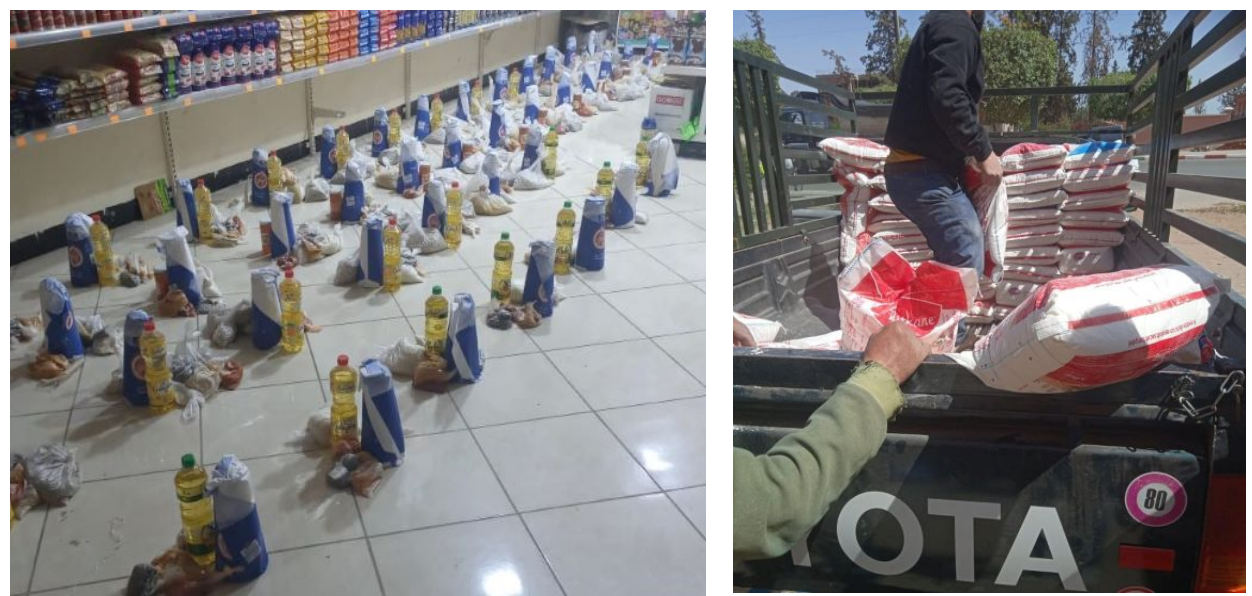
Zakat al-Fitr money received by IFI used to buy food and distribute it to the poor in some Muslim countries

The Zakat al-Fitr in the year 2021 (1442 H) amounted to \notin 11,228 . In the year 2022 (1443 H) Zakat al-Fitr was \notin 17063.00 .