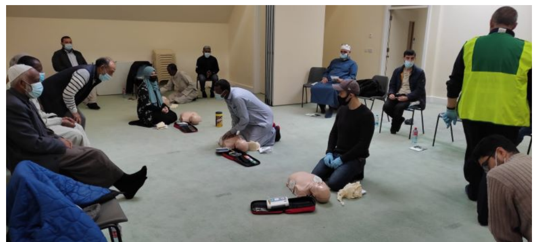
IFI staff First Aid Training

On the 3<sup>rd</sup> of November 2021 the IFI staff attended a one-day first aid training course. The IFI staff have received basic health and safety training in all the mandatory fields and are fully compliant with HSA guidelines until 2024.